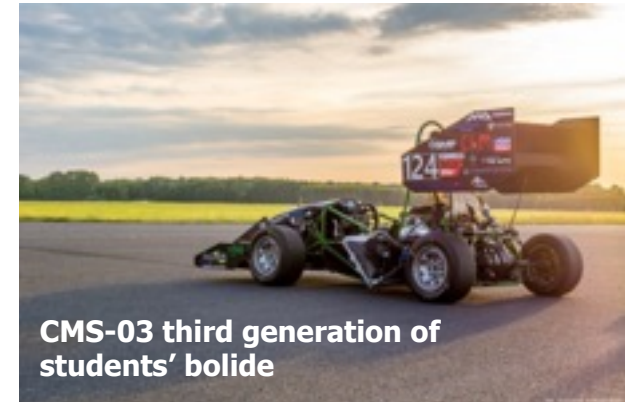
CMS-03 third generation of students' bolide

Bialystok University of Technology is the subject matter partner of the project and supports its students in their efforts.